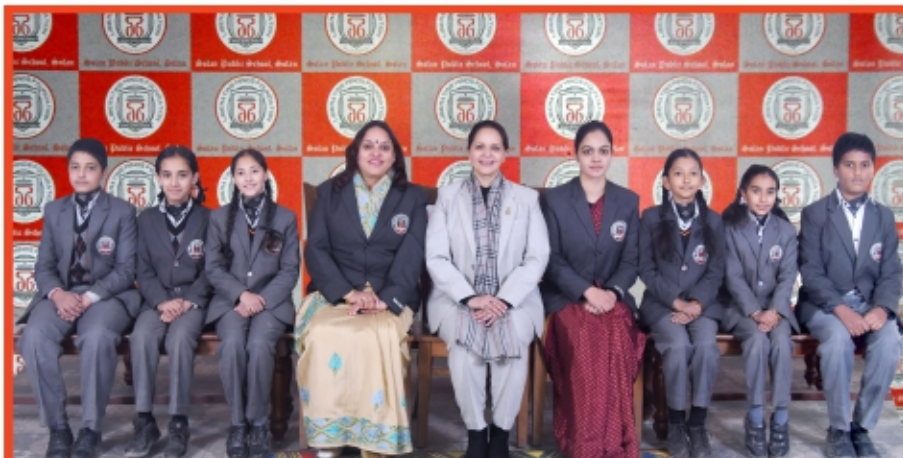
GRADE : VI