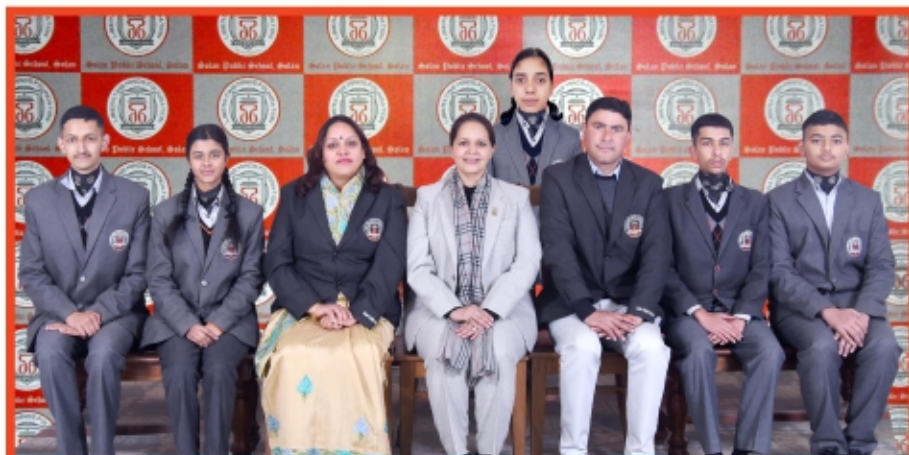
GRADE : X