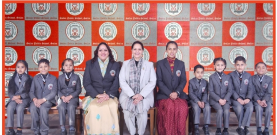
GRADE : I