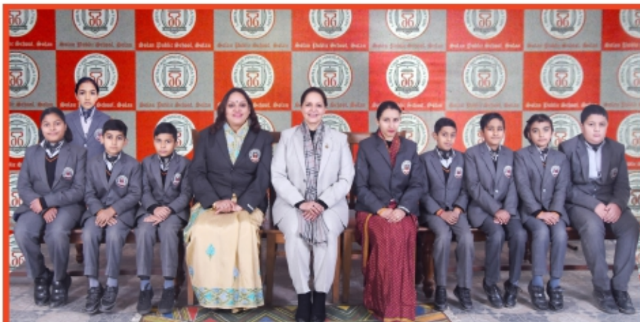
GRADE : IV