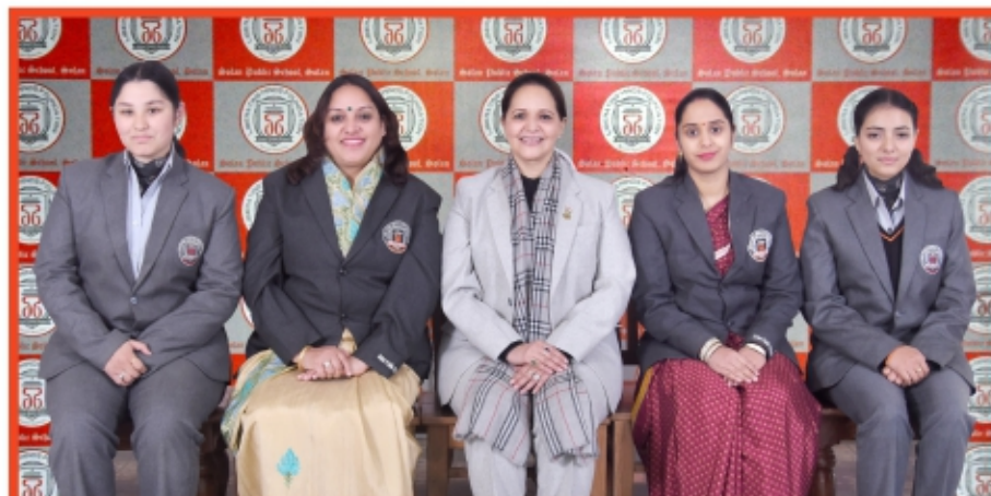
GRADE : XII