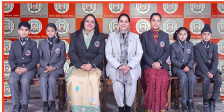
GRADE : V