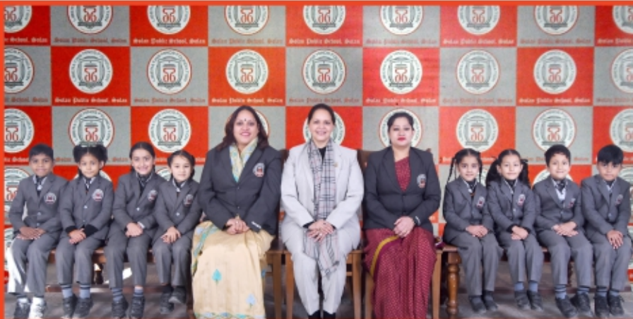
GRADE : UKG