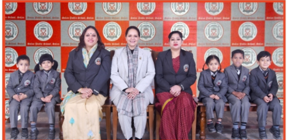
GRADE : LKG