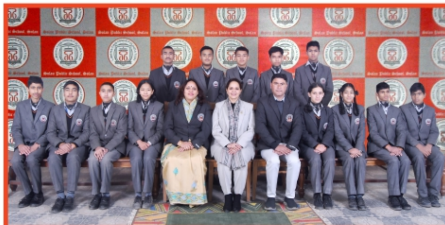
GRADE : IX