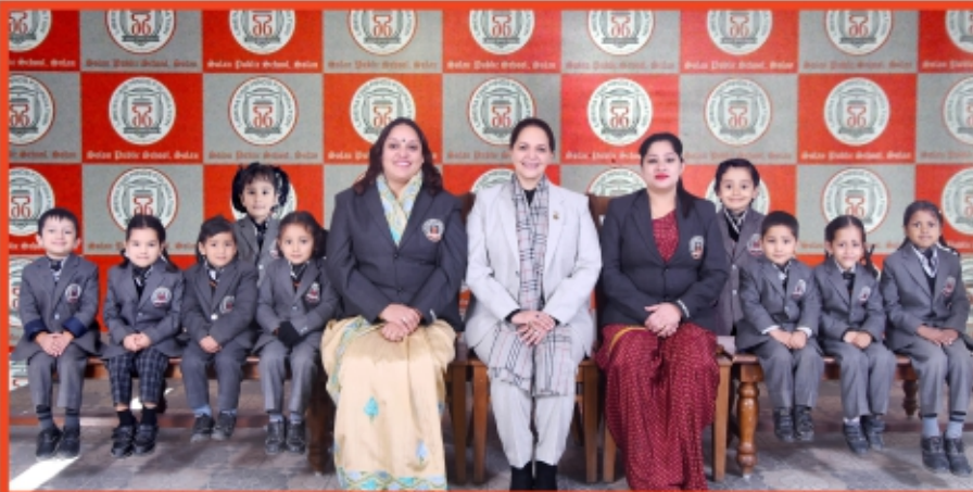
GRADE : NURSERY