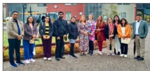
Elementary school visit & workshop