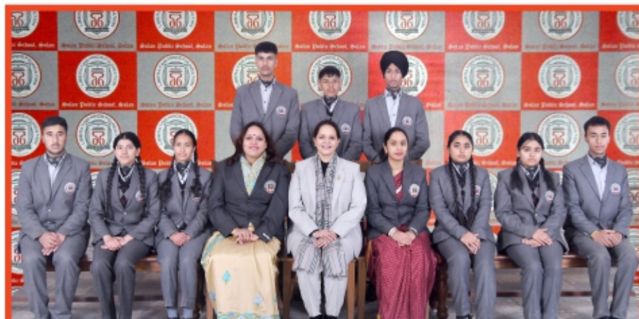
GRADE : XI