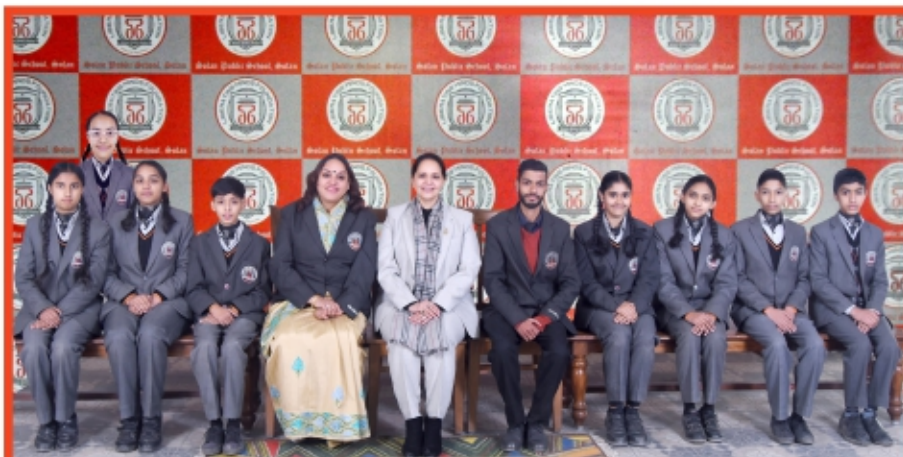
GRADE : VIII