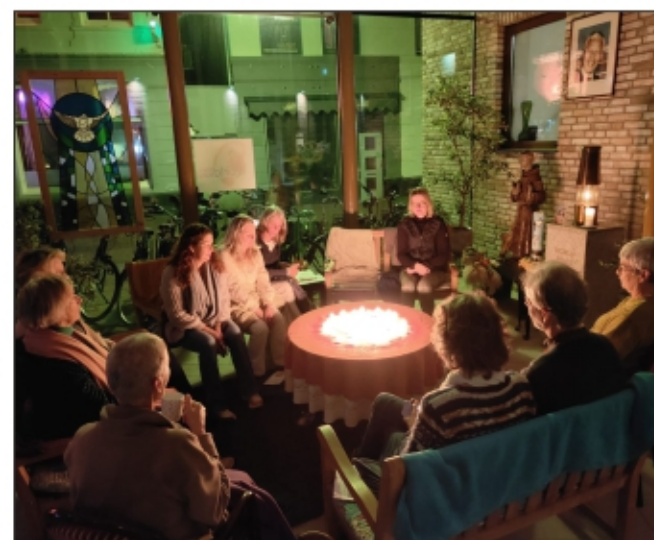
Diwali celebrations at World Peace centre, Netherlands