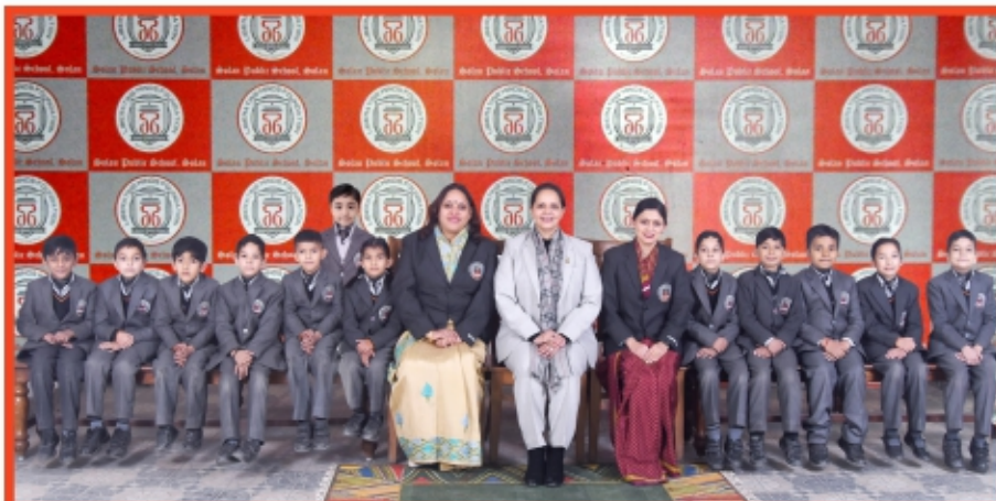
GRADE : II