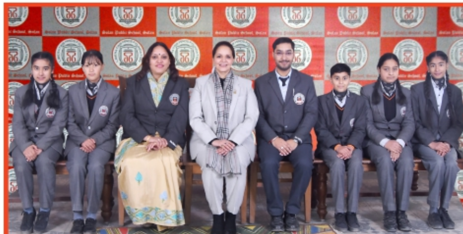
GRADE : VII