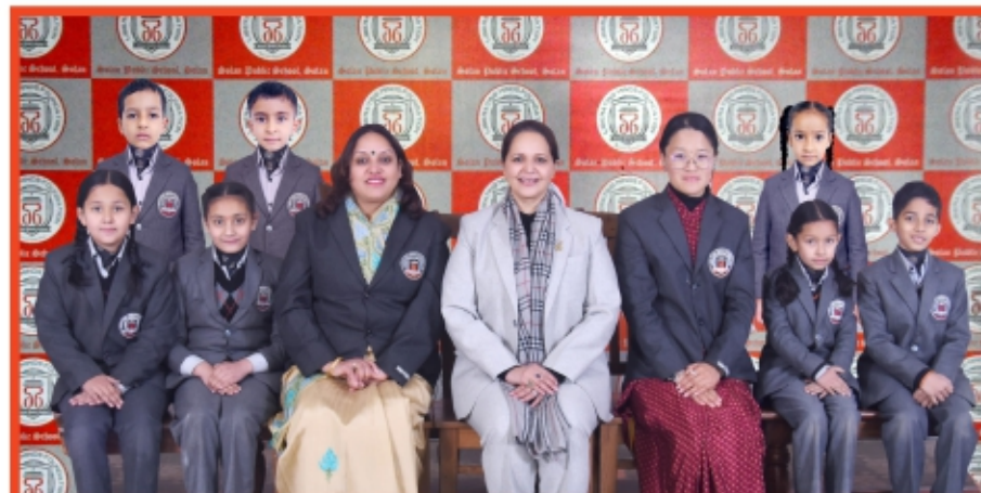
GRADE : III